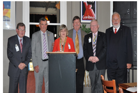
New Board Members for 2016-2017