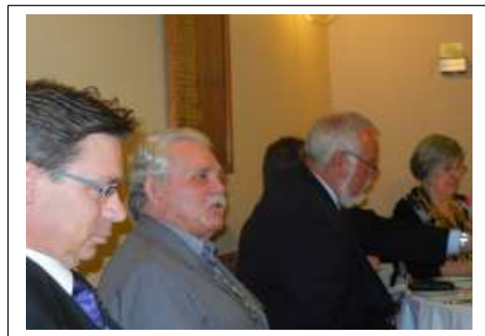
Members listening to a guest speaker.