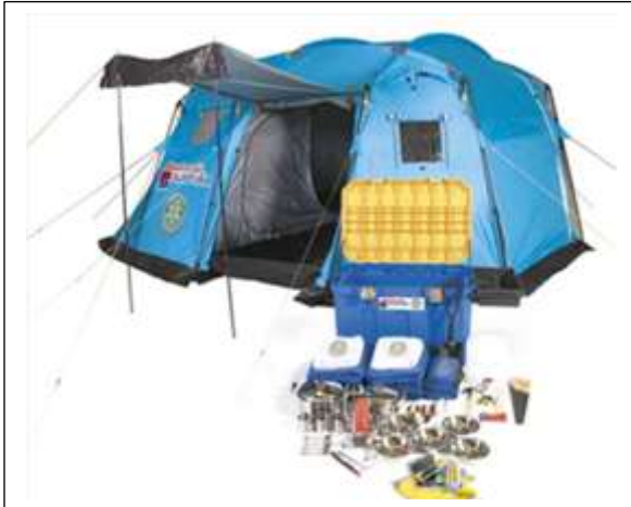
Disaster Aid Box and contents