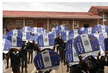
Tutudesks delivered to students in Africa