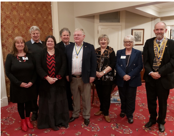
Rotary Club of Adelaide Parks