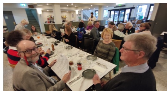
An Italian dinner after visiting the Space Discovery Centre