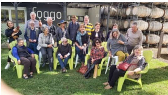
Enjoying good food, wine, and company at McLaren Vale