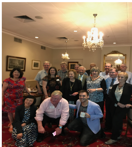
AFTER THE INTERACTIVE WORKSHOP ABOUT WEBSITES AND SOCIAL MEDIA