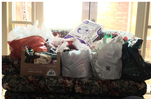
Donations for Magdalene Centre