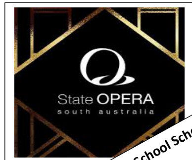
RCAP funds Winter School Scholarship