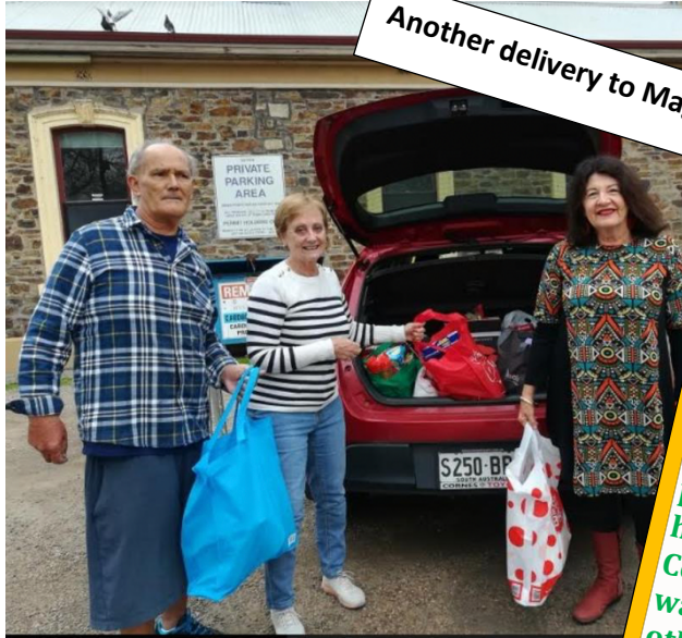
Another delivery to Magdalene Centre